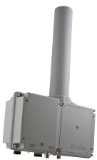
Itron CCU 100