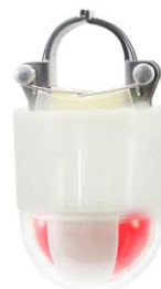
Indicator in flag & flashing status