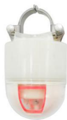
Indicator in ready status

On detection of fault current above the fault sensitivity threshold and for the minimum required duration the JJZ-FF-C indicator will respond both by mechanical Flag Indicate, and flashing, high-power LED indicate.